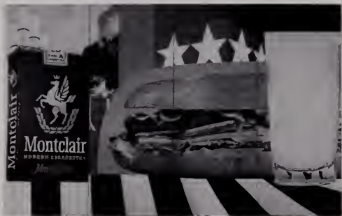
Tom Wesselmann. Still Life Number 36 , 1964. Oil and collage on canvas; four panels, 120 x 192¼ inches overall. Whitney Museum of American Art, New York; Gift of the artist 69.151.

Another artist who has been influenced by billboards is James Rosenquist, whose juxtaposition of seemingly disparate images forces the viewer to question the relationships implicit in conventional