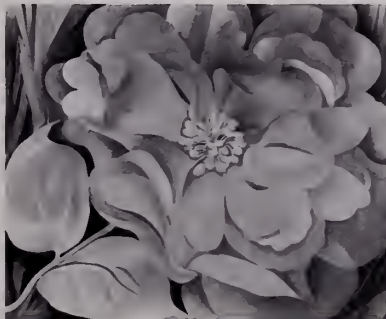
Georgia O'Keeffe. The White Calico Flower , 1931. Oil on canvas, 30 x 36 inches. Whitney Museum of American Art, New York; Purchase 32.26.