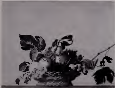
Michelangelo Merisi da Caravaggio.