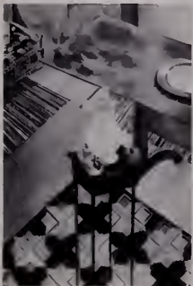
Charles Sheeler. Interior , 1926. Oil on canvas, 33 x 22 inches. Whitney Museum of American Art, New York; Gift of Gertrude Vanderbilt Whitney 31.344

Sheeler's art was directly influenced by his work as an industrial photographer. In fact, he often used photographs as the basis for his paintings. From the start his attitude toward the visual world—exact, scientific, and calmly detached—informed both his photography and paintings. 8 The Shaker-style house he lived in provided the simple architectural environment he chose to depict in his art. In Interior of 1926,